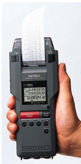
Printable Stop Watch – Seiko – S149 - @ $325.00 – Check EBAY.

Open Water Judge Training Manual – USA Swimming website – look under Volunteers/Officials/Training Resources/Open Water Swimming Training Manual