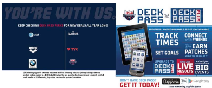
Back of card